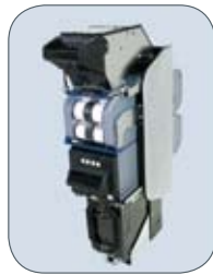
Bulk Note Feeder installed on Bill-to-Bill Currency Management System™.